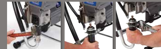
1. LOOSEN LOCKING NUT

Airlessco keeps you productive with the Quick Repair Pump system. Reduce downtime and change the pump on the job — no special tools needed!