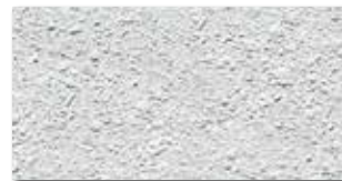
ORANGE PEEL, FINE SPLATTER

Examples shown below illustrate results using Mastic gun. (See page 13 for Mastic Gun Atomizer Kit)