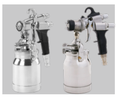
Best-in-Class HVLP Guns Deliver the ultimate finish and maximum control.

High-end woodworking, cabinetry, and furniture projects require a finish that only a Capspray HVLP system can deliver. The Capspray Series is efficient and durable with unmatched portability and intelligent design making jobsite life easier.