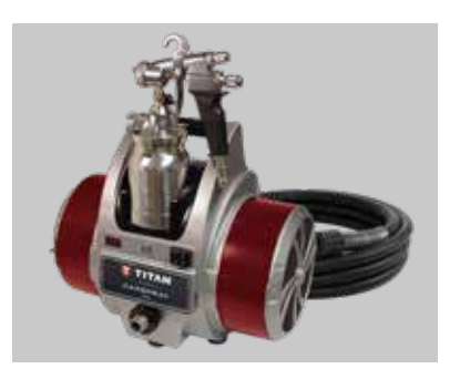
Choose From a 3- to 6-stage Power Spray light- to heavy-bodied coatings without thinning.