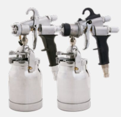
The Capspray 105 comes with a 30' air hose, 5' whip hose, #3 & #4 Pro Sets and the Maxum II or Maxum Elite gun