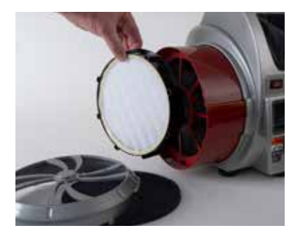
Quick Change Dual Air Filtration No tools required to change filters for atomizing and cooling air filters.