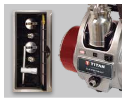
Onboard Tools Convenient built-in cup holder, tool box for air caps and projector sets

High-performance automotive type air filter delivers clean atomizing air and a consistent fan pattern.