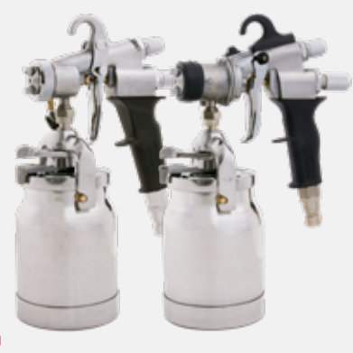
The Capspray 115 comes with a 30' air hose, 5' whip hose, #3,#4 & #5 Pro Sets and the Maxum II or Maxum Elite gun